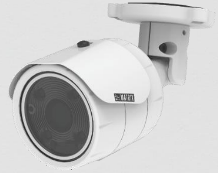
SATATYA MIBR80FL28CWS 8MP IR Bullet Camera with 2.8mm Lens

Matrix Professional Series IP Cameras are built using superior components such as Sony STARVIS sensor and higher MTF lens to offer unmatched image quality especially during the low light conditions. Powered by True WDR algorithm, these cameras offer consistent image quality even in highly varying lighting conditions. Built in intelligent analytics including Intrusion Detection, Trip Wire, etc. ensure real-time security. Moreover, H.265 compression and Automatic Motion based Frame Rate Reduction save bandwidth and storage up to 50%.